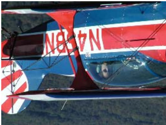
Pitts Stop Sept. 2003

This month I'll spare you from the lengthy verbage I've been spitting out for the last few months. Not that anyone actually reads this stuff anyway. This will be a pretty short column since I've got to head out to the left coast in a few hours and for whatever reason, there just doesn't seem to be that much news to relay.